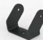
Standard U Bracket (Included) UBS-24