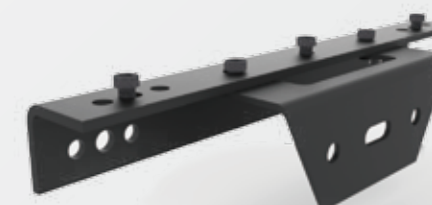
L-type Triple Mount Bracket LBS-003