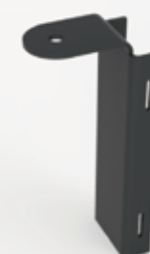
U-type Pole Mount Bracket UBS-001