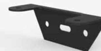
L-type Dual Mount Bracket LBS-002