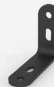
L-type single Mount Bracket LBS-001